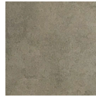
Ceramic Tile (Bathroom Floor)