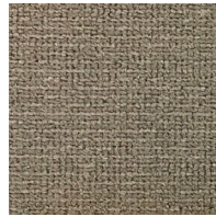
Carpet Tile (Bedroom)