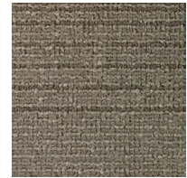
Carpet Tile (Lobby & Corridor)