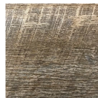
Luxury Vinyl Tile (LVT) (Living Area)