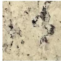
Granite (Kitchen & Bath)